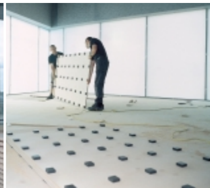
Easy two man installation