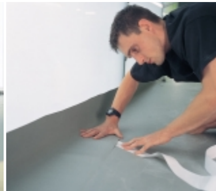
Taping under joints with double-sided tape