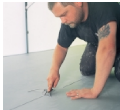
Grooving joints prior to welding