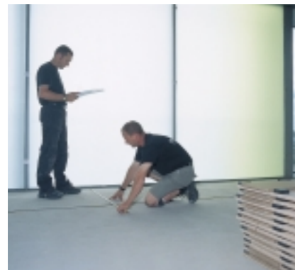
Detailed site preparation

Liberty by Harlequin is a 'floating' floor system - used at Laban in the permanent dance studio version - other versions are available for touring use. Panels are formed from multiple layers of birch, bonded with waterproof phenolic resins to form an 18mm thick and stable substructure for the vinyl surface. Each full size panel has 45 dual density elastomer blocks spaced at regular centres, which absorb impact and give a consistently even energy return over the entire surface of the floor. Harlequin Liberty sprung floor panels combine consistent shock absorption and uniform suspension across the whole floor, with no hard spots at the joints. To find out more about Harlequin Liberty click here. Link to product data.