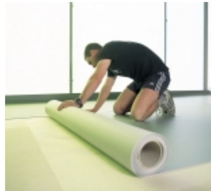
Rolling out the dance vinyl