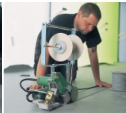
Automatic welding machine