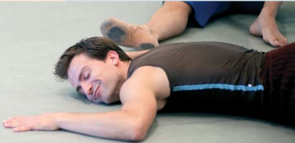
Harlequin STUDIO™ floors