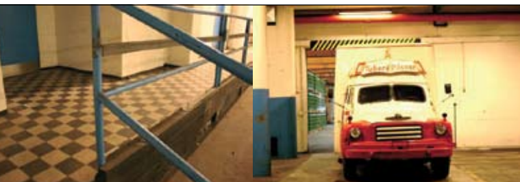
The Dansescenen and the Dansens Hus are moving into the old premises of the Carlsberg Royal Brewery.

Moreover, Dansescenen has not finished surprising us. In the summer, the institution will move along with the Dansens