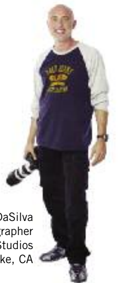
Paul DaSilva Photographer DaSilva Studios Toluca Lake, CA