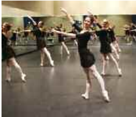
Calvary Christian Academy Ft Lauderdale, FL Harlequin Activity with Standfast vinyl surface