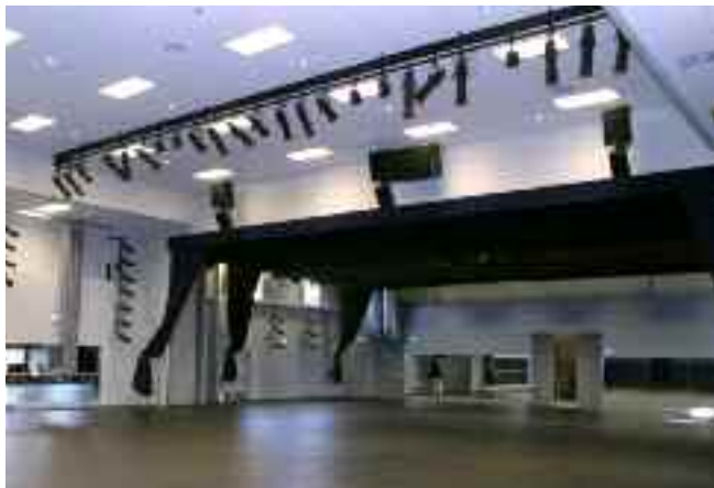
National Dance Institutes of New Mexico Santa Fe, NM Harlequin Activity with Cascade vinyl surface