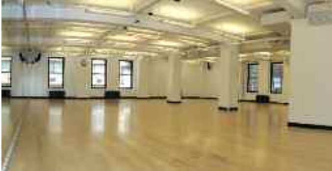
Broadway Dance Center, New York, NY Harlequin Activity with hardwood surface